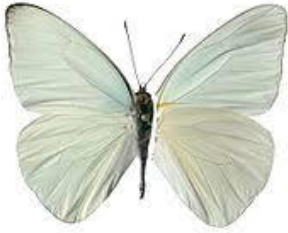
Great Southern White